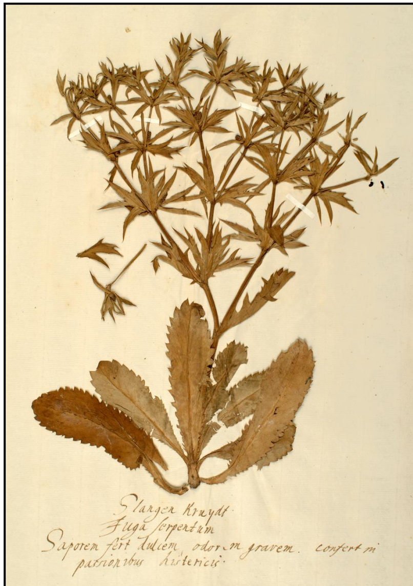
Slangenkruidt ( Eryngium foetidum )

Thesis of a research internship, part of the EBC Master programme Biology